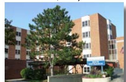
Winchester House, Libertyville