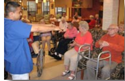
Activities at the Wauconda HealthCare and Rehabilitation Centre

Many people expressed the desire to be able to age at home. They believe a Winchester campus with a senior center would help people remain in their homes until they needed a higher level of care. One person called it the “Center for Aging Well.” The center could encompass senior day care, social