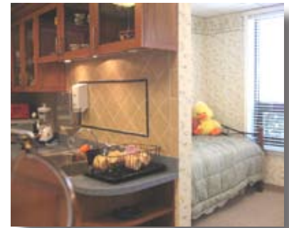
Interior views of the Wauconda HealthCare and Rehabilitation Centre

The Green House Project website: http://www.thegreenhouseproject.com