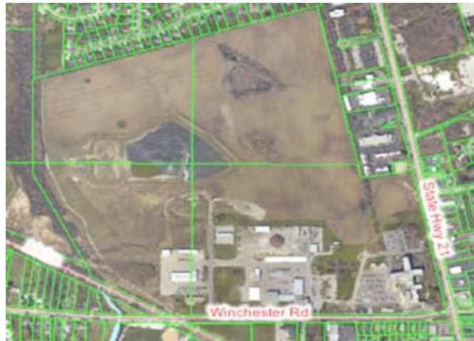
Aerial view of the Winchester House property at Milwaukee Avenue and Winchester Road in Libertyville.

Funding for this report and for the Lake County United Winchester House Initiative has been provided by the Healthcare Foundation of Northern Lake County ( www.hfnlc.org ).