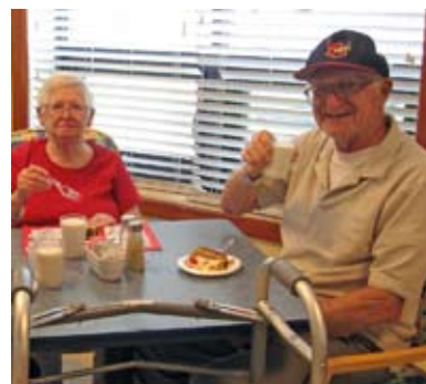
Lunch at the Wauconda HealthCare and Rehabilitation Centre

OVERVIEW: Alden of Waterford is a campus with a full continuum of care for seniors. The campus is lovely, with many gardens, waterfalls, swans, and geese. It is made up of independent senior housing (both rental and for sale), assisted living, memory care, and skilled nursing care.