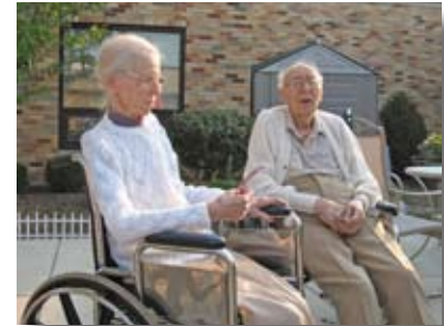
Residents of the Wauconda HealthCare and Rehabilitation Centre

Lake County United is a citizens' organization composed of 37 churches, synagogues, mosques, and non-profits working to improve the quality of life of Lake County residents. Founded in 2003, the organization identifies community concerns and needs, builds relationships across the county, and works as a united power for human dignity, social justice, and the greater good. Lake County United's current membership is listed on page 10.