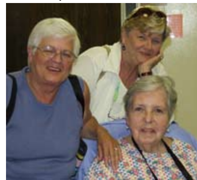
Lake County United Leaders